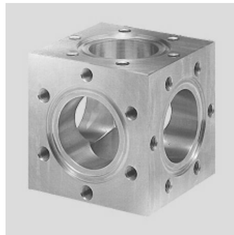
2 3/4" Size Shown